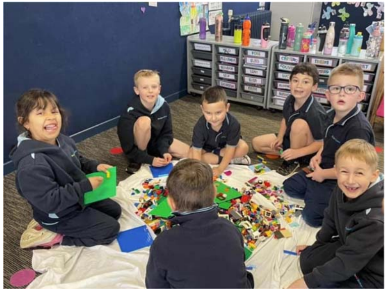
Our lego builders

We are looking forward to round two of Clubs in the first part of term three and seeing what the tamariki create, discover, challenge themselves with during their sessions.