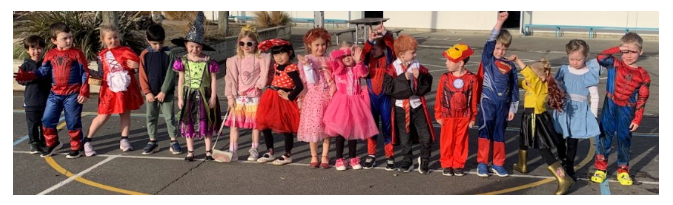
Room 11 students get into the groove.