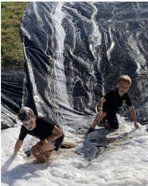
What a fabulous day today at the Mt Biggs Tough Kids event!