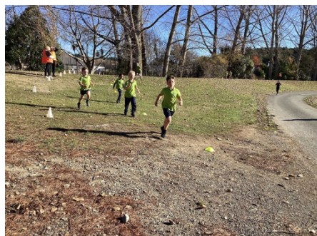
Cross Country on Monday.