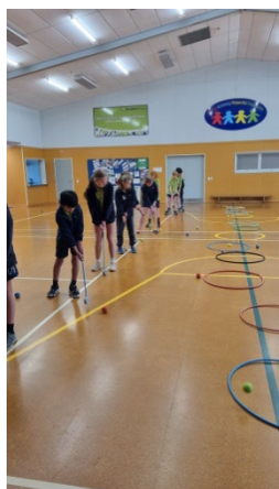
Golf coaching in the hall.