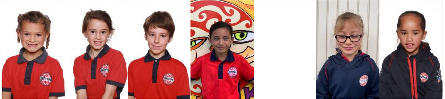
Kora-Leigh Room 2

These students earned the most Classdojo points in their classroom during the w