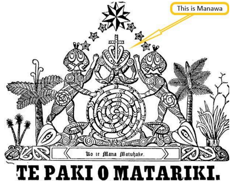
The Coat of Arms Adopted by the Maori King Tawhiao.

The Kiingitanga have their own coat of arms which incorporates the Matariki stars. The central figure MANAWA urges the people to show regard for others. The two hands of the Manawa hold his tongue symbolising that people should be cautious with what they say. The CROSS is a symbol of Christianity which is an important concept within the Kiingitanga. Manawa is sheltered by Matariki - the constellation that heralds the Māori New Year and signals a new beginning.